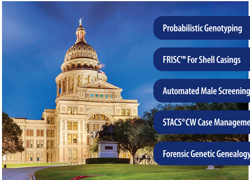
Delivering justice daily from the heart of Texas.

Maximizing DNA Recovery from Challenging Samples. Because we, too, want to solve every case, Signature Science's Center for Advanced Genomics engages in high-level genomic research, development, and testing and evaluation to address the scientific and technical forensic challenges facing our criminal justice system. Our scientists work on technology advancements include developing novel methods for maximizing DNA recovery in both yield and quality from forensic samples subjected to challenging conditions.